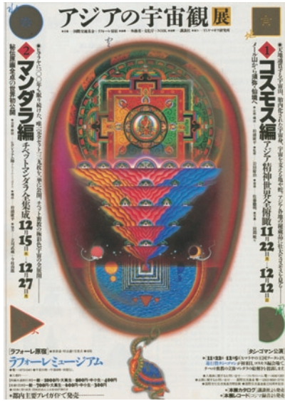
Fig.1 Leaflet of the exhibition organized by Sugiura

ness of its visual culture. Significantly, he has always been conscious that by going to India he would deepen the understanding of Japan as well as India. He began energetically producing books and holding exhibitions on the pan-Asian design history based on his experience and research. For example, he published Asian Cosmos and Mandala , in the 1980s and also organized an exhibition with the same title (Sugiura, 1982). The exhibition's main significance was to reunite the esoteric Buddhist teachings born in India, and now surviving in Tibetan cultural spheres and Japan after one thousand years. Here he began his journey of inquiry from India's 'Gusharon (abhidharma Storehouse Treatise)', his goal was Mt. Fuji in Japan, and the road of the journey was the geographical process of idealization of Mount Meru (considered in Buddhism as the mountain located at the centre of the world) prevalent in Asia. The exhibition was composed of two parts: Cosmos and Mandala [Fig.1]. Cosmos represented the vertical image of Asian space, and Mandala represented the horizontal image, and where the two axes meet, the whole three-dimensional image of the Asian space was to emerge. From here, Sugiura deductively explains why the Japanese have an almost religious feeling towards Mt. Fuji: the idea of Asian Cosmos has partly flown into the Japanese mentality via China, Thailand and other Asian countries over time, and has formed this deep-rooted feeling towards the highest mountain in the country.