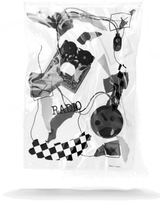
Figure 4: Daniel Weil, Radio in a bag , 1981, aka Hommage à Marcel Duchamp

Similar is the case with Daniel Weil's Radio in a Bag , which is considered one of the most well-known speculative design projects. Consequently, the question arises as to what form a radio should and must have, and what happens when one completely dispenses with conventional values. Weil's radios possess both product design qualities and artistic autonomy. Wolfgang Welsch claims that the miniaturization of microelectronics dissolves the maxim form-follows-function (23). Digital devices have no function per se or can perform different functions (black box): Decoupling of the outer form from the inner product structure (24).