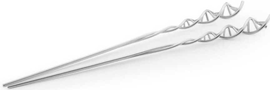
Figure 2: The golden chopsticks – theoretical object from Bazon Brock, (Source: https://www.georghornemann.com/en/collaborations/bazon-brock.html viewed on Nov. 5 th 2023)

asceticism. The golden chopsticks visualise this principle. If we were to give our golden chopsticks to billions of Asian chopstick users, the sublime treetops of South American primeval forests would not have to fall victim to logging for the production of wooden chopsticks (21).